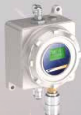
ICM K 2.0 AZ2

Hazardous environment permanently mounted in-line contamination monitor. High-risk and explosive environments.