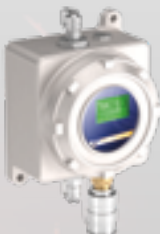
ICM K 2.0 AZ2

Hazardous environment permanently mounted in-line contamination monitor. High-risk and explosive environments.