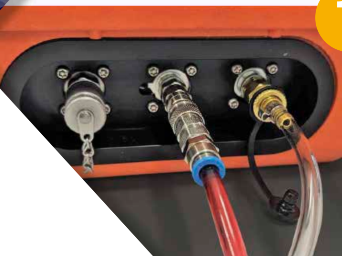
Suction connection and waste outlet in use

The first step is simply to connect the CML4 to an Online M16 test point (pressure range 2-420 bar / 29-6091 psi) or to the applications reservoir (zero pressure). The CML4 features a self-priming metering pump which enables analysis of unpressurised systems. Easy-fit standard hydraulic connections maintain high environmental protection ratings.