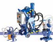
MOBILE FILTRATION UNITS